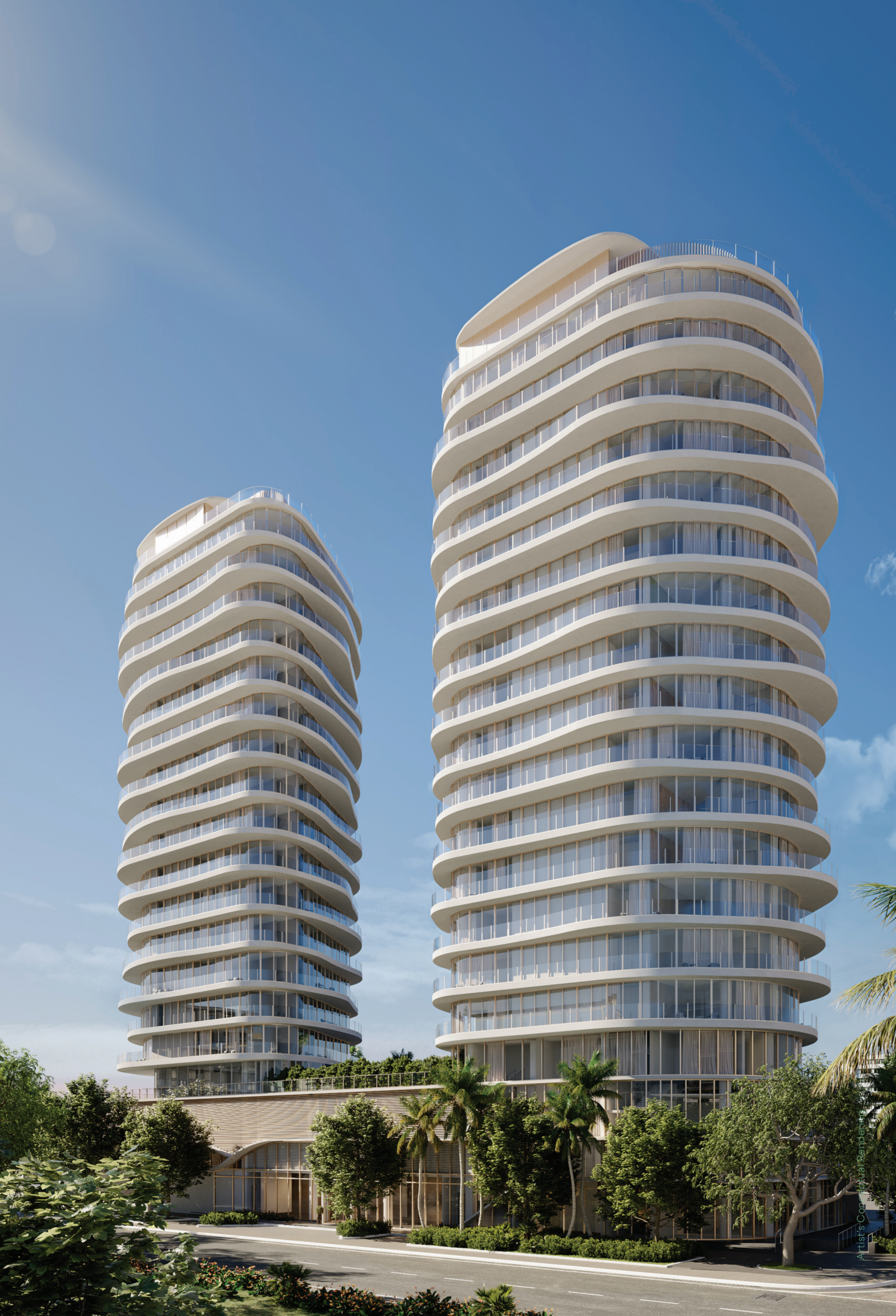
Artist's Conception by Benedito