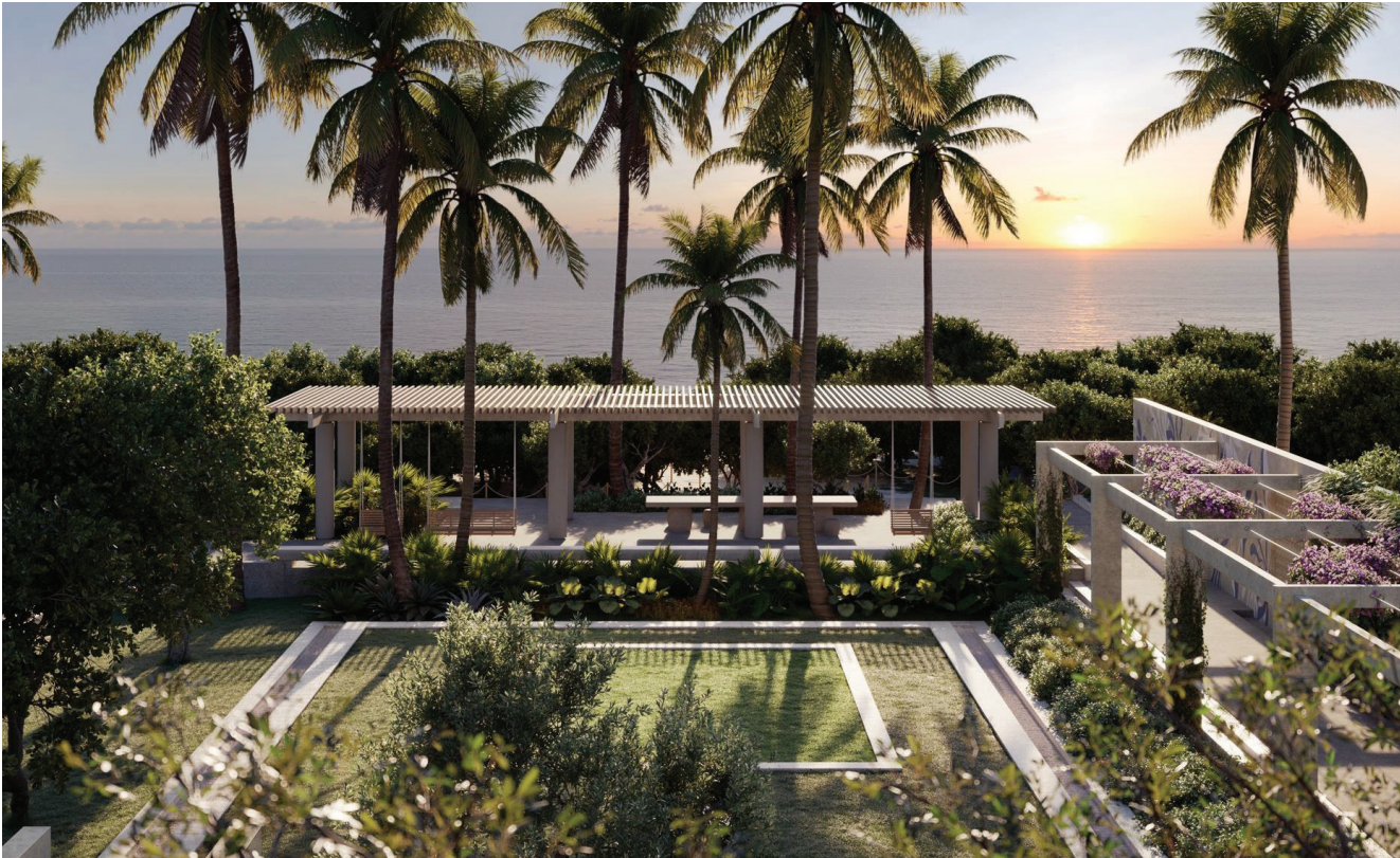
Artist's Conceptual Renderings

West 8 emphasizes harmonious integration of nature and built environment through innovative design strategies, fostering sustainable landscapes that benefit both ecological health and human well-being.